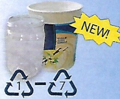
#1-7 Plastic tubs & screw-top jars (no lids, no #7 PLA compostables, do not flatten)