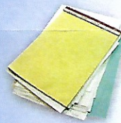
White or pastel office paper