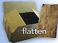
Corrugated cardboard & paper bags