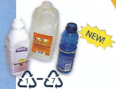
#1-7 Plastic bottles & jugs (no lids, no #7 PLA compostables, do not flatten)