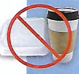
Styrofoam® & paper to-go boxes & cups