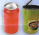
Cans (do not crush or flatten)