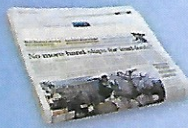
Newspapers & inserts (no bags)