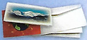
Opened mail & greeting cards

You can now place all recyclables in one bin!