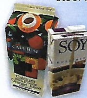
Paper milk/juice cartons (no foil pouches, do not flatten)

No need to remove: paper clips, stamps, address labels, staples, tape, wire, metal fasteners, rubber bands, spiral bindings, plastic tabs.